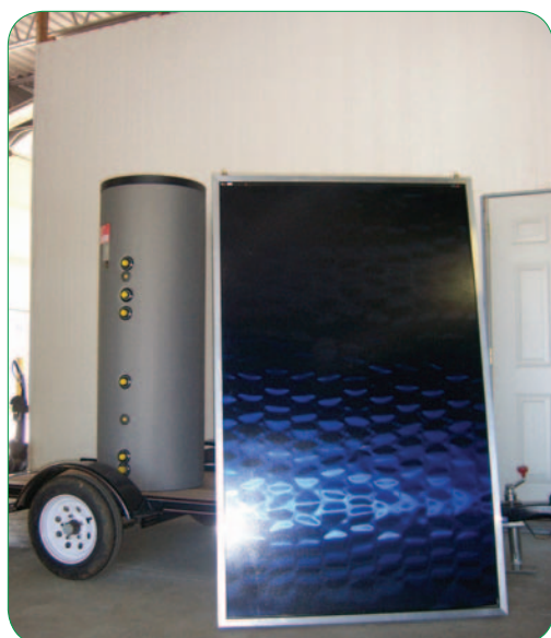
Solar Storage Tank and Solar Collector