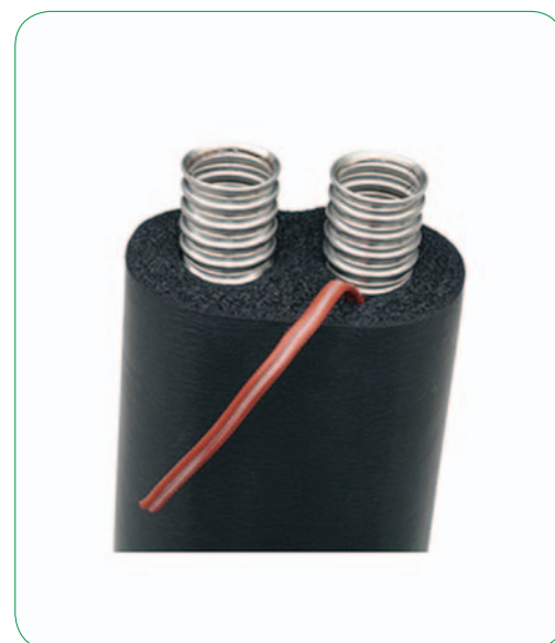
Solar Piping and Quick Connect System