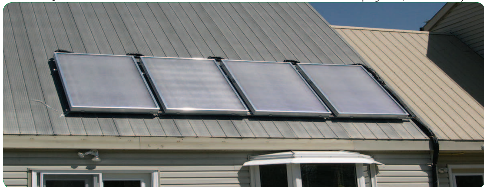
Installed Solar Collector